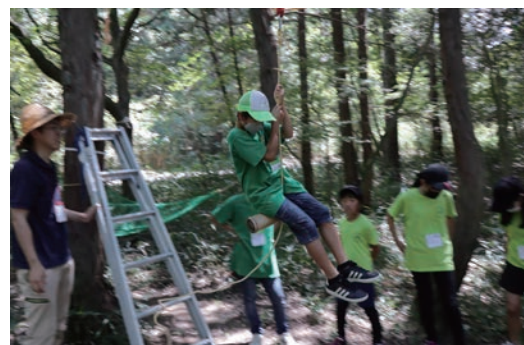
Exchange Meeting (Mie Prefecture)

The Green Scouts are actively engaged in activities such as interactive nature experiences in forests, public service activities, camping and other recreational activities, making use of various regional characteristics. Activity presentations and exchange meetings by Green Scouts members selected nationwide, and Green Scouts leaders training sessions are held to encourage Green Scouts and to promote autonomous activities by them.