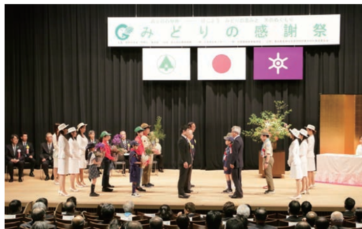
Green Thanksgiving Ceremony

April 15 to May 14 is also designated as Greenery Month and various events focusing on greenery and forests are held throughout Japan. In Tokyo, the Green Thanksgiving Ceremony is attended by a member of the Imperial Family of Japan.