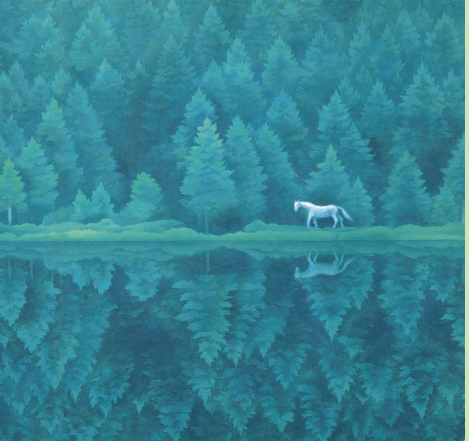
Kaiti Higashiyama “Midori-hibiku” (Echoing Green) ATELIER KAITI HIGASHIYAMA, Nagano Prefectural Shinano Art Museum