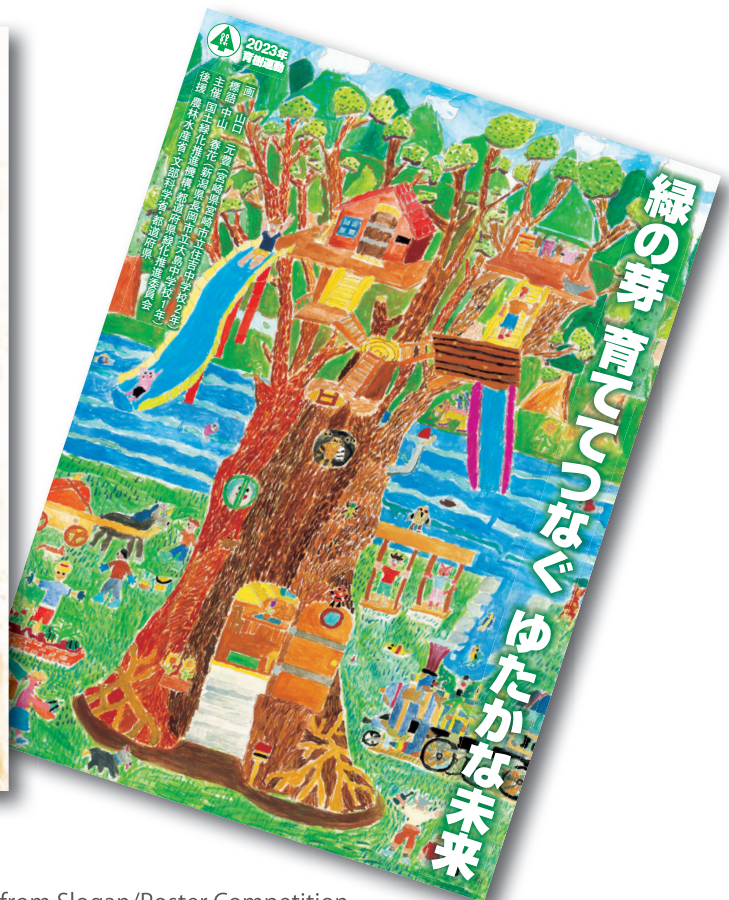
Outstanding Works from Slogan/Poster Competition (Adopted Posters in 2023)