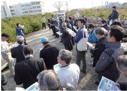
Workshop on Restoration of Coastal Protection Forests

Profits from the Funds are used for public awareness activities to facilitate participation of people in forest-related activities, surveys and research on public functions of woodlands including relationship between forests and water, and international exchange related to afforestation promotion. These initiatives aim to develop an understanding on afforestation and obtain cooperation by public.