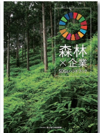
SDGs Handbook (for corporations)