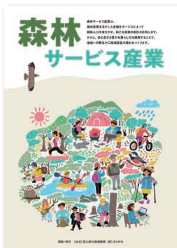
Forest-related Service Industry Brochure

'Forest-related Service Industry' utilizes services from forest eco-system in diverse fields such as health promotion, tourism and education multiply. NALAPO supports the industry by implementation of research projects, provision of information and hosting of exchange meetings to increase numbers of visitors in forest areas and to promote their understanding of afforestation drive.