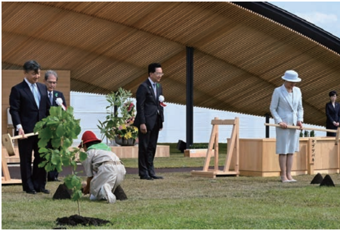
73 rd National Tree Planting Festival (Iwate Prefecture)

Their Majesties plant seedlings and sow seeds by hand alongside other participants. Planted seeds are nurtured carefully and grown trees will be transplanted on public land.