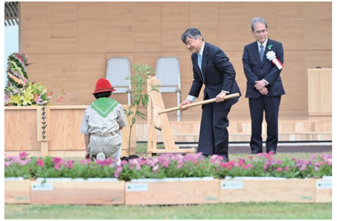
73 rd National Tree Planting Festival (Iwate Prefecture)