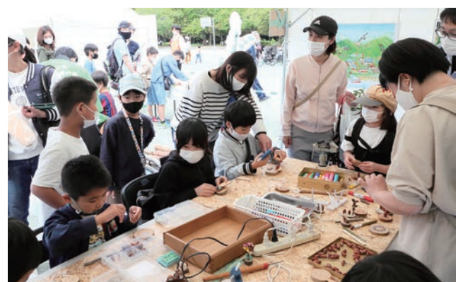
Hands-on Spot for Woodwork Experience