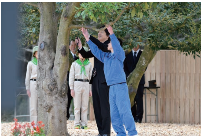
46 th National Tree Care Festival (Ibaraki Prefecture)

The National Tree Care Festival is held in each autumn to raise awareness that sufficient protection and caring activities are necessary for healthy forests. It is attended by Their Imperial Highnesses the Crown Prince and Crown Princess of Japan.