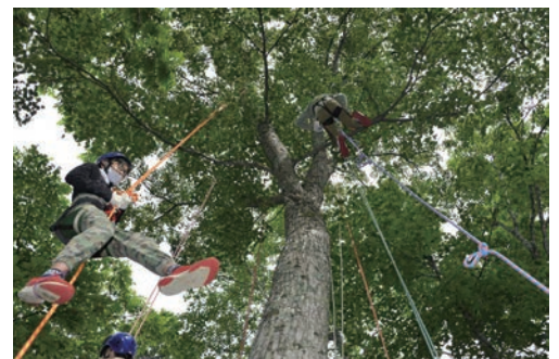
Climbing Trees (Hokkaido Prefecture)