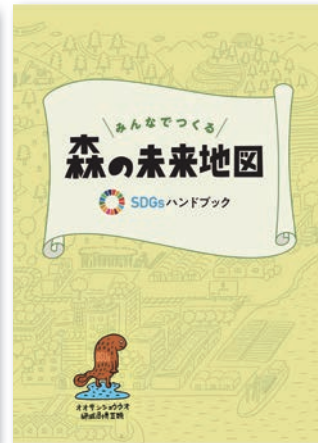
SDGs Handbook (in general)