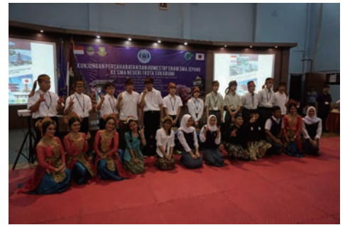
International Exchange of Highschool Students Major in Forestry (Indonesia)