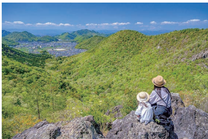
Outstanding Work from Photo-contest of the 30 th Green Thanksgiving Festival