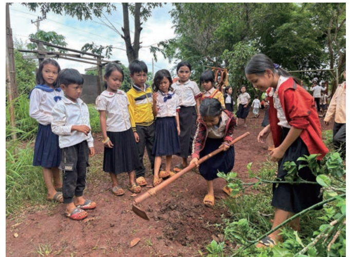
Primary School Volunteers in Planting Activities (Kingdom of Cambodia)