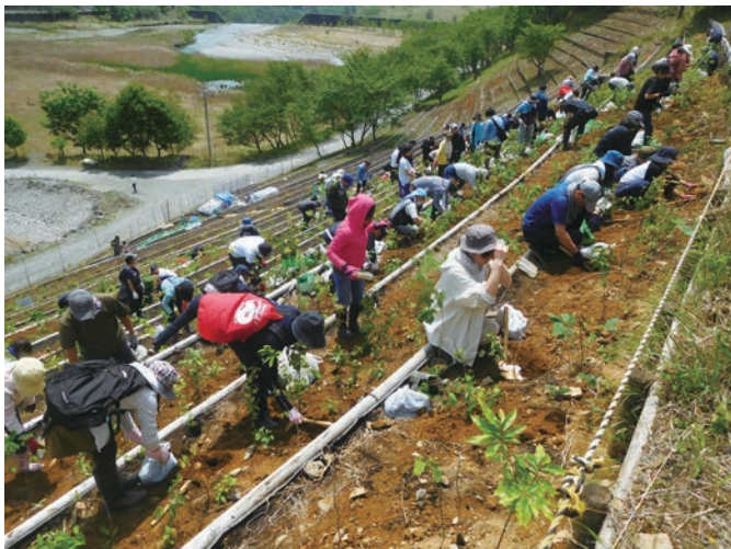
Volunteers in Planting for Forest Rehabilitation (Tochigi Prefecture)