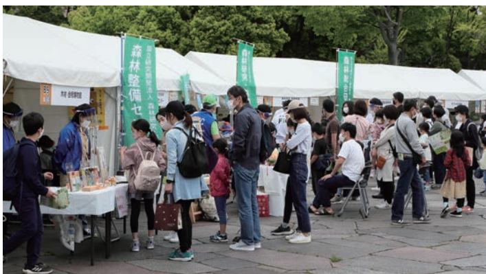
Enjoy Greenery Festival