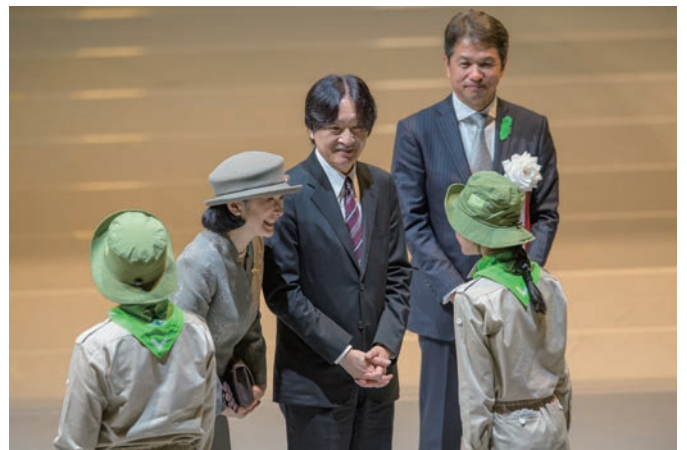
46 th National Tree Care Festival (Ibaraki Prefecture)